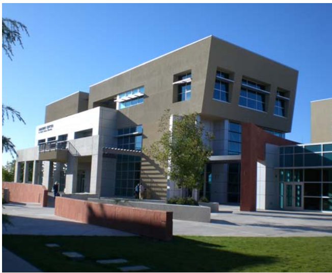
Domenici Center at The University of New Mexico

Members of PRIMENet (Primary Care Multi-Ethnic Network) met at the University of New Mexico in October 2009. Members met to discuss implementation of a grant to be started across many of the networks soon (see page 2, PRIMENet Study) and to review a number of potential projects to be implemented by PRIMENet.